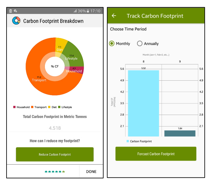
Fig. 1. Key Screenshots of Mau Carbon Footprint