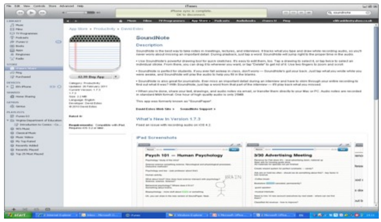
Figure 1: Screenshot of SoundNote, accessible through iTunes (Apple Store)

The focus of the project shifted in that it sought to explore if an inexpensive iPad application called <u>SoundNote</u> (version 1.7.3) could be used for the efficient provision of electronic audio feedback to students on the basis of a mock test they had completed in seminars (something that had previously been done face to face and was very time consuming).